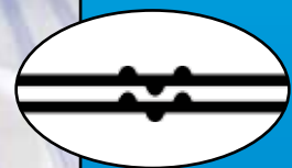
Profile of "nested" strips